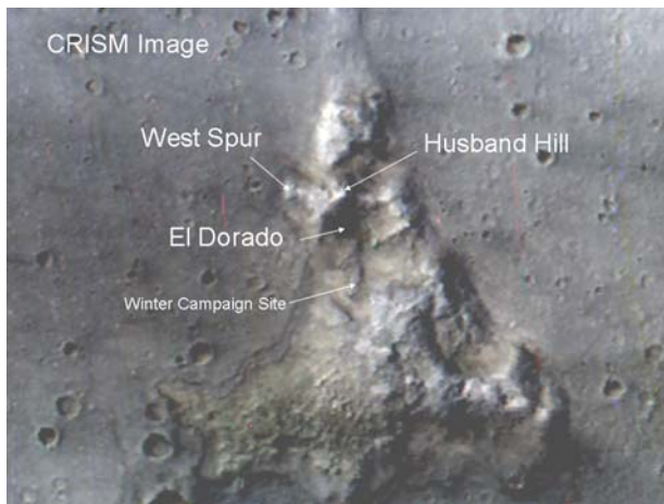
Figure 1 – CRISM false color IR view (2.5, 1.5, and 1.1 \mu\text{m} I/F) of the Columbia Hills and surrounding plains. North is to the top and the image covers 5.7 km in width. Spirit's Winter Campaign site is to the south of Husband Hill, in the Inner Basin. McCool Hill is to the southeast of the Campaign site. Frame: FRT00003192_07_SC165L.

References: [1] Arvidson R. E. et al. (2006) JGR , 111, E02S01, doi:10.1029/2005JE002499. [2] Murchie S. L. et al. (2007) JGR , in press. [3] McEwen A. S. et al. (2007) JGR , in press. [4] Squyres S. W. et al. (2007) Science , submitted. [5] Morris R. V. et al. (2007) LPS XXXVIII , this issue.